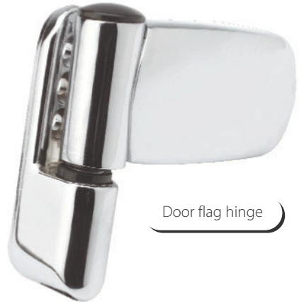
Door flag hinge

Many of today's hinges, dead bolts and locks are designed to be self lubricating so no ongoing maintenance is required. Door flag hinges that have nylon bearings do not require any maintenance.