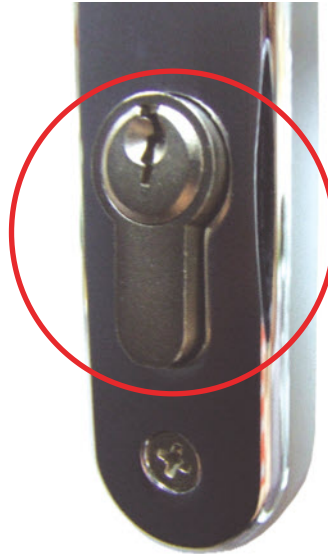
Door bolt cylinder

Discolouration of mastic seals is a natural occurrence and cannot be avoided. This does not affect the performance of the seals.